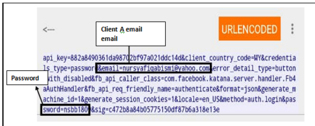
Figure 2 Password encryption ability result for Facebook Messenger