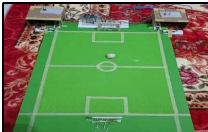
Figure 5. The prototype of a football pitch that combining the sensors.

Next, the development phase includes coding and compose the prototype. This prototype may look simple, but it is different from the others as it was explicitly produced based on the results obtained during the preliminary study phase, as shown in Figure 5.