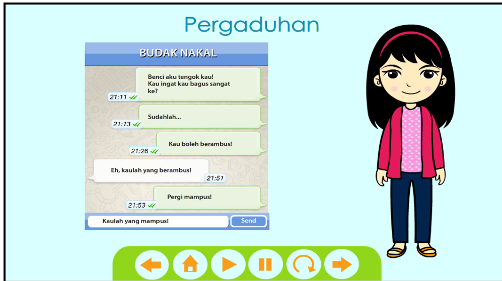
Figure 4: Screenshot of an Example of Frequently-Occurring Cyber-Bullying Behaviour (Flaming)