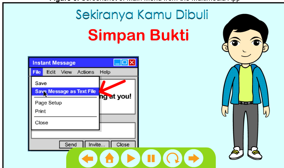
Figure 7: Screenshot from the Multimedia App