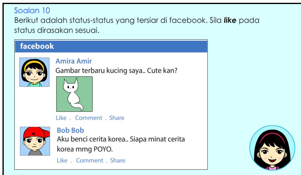
Figure 8: Screenshot of the Reinforcement Activity