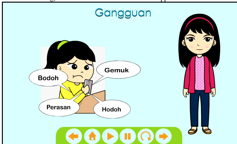
Figure 3: Screenshot of an Example of Frequently-Occurring Cyber-Bullying Behaviour (Harassment)

The related cases are highlighted in this app in animation form and reinforcement activity. According to Jonassen (1999), related cases or worked examples should be given to learners to enable case-based reasoning and enhance cognitive flexibility. In this Multimedia App, related cases show examples of frequently-occurring cyber-bullying behaviour, the consequences of cyber-bullying as well as action that must be taken to overcome this problem. Learners' memory scaffold will be enhanced by presenting examples which have similarities in terms of problems, context, situation and outcomes. Learners will make comparisons between the related cases highlighted and the problems they face in finding the best way to overcome the problem. Figure 3 and 4 shows examples of frequently-occurring cyber-bullying behaviours (e.g. harassment and flaming) as related cases of this Multimedia App.