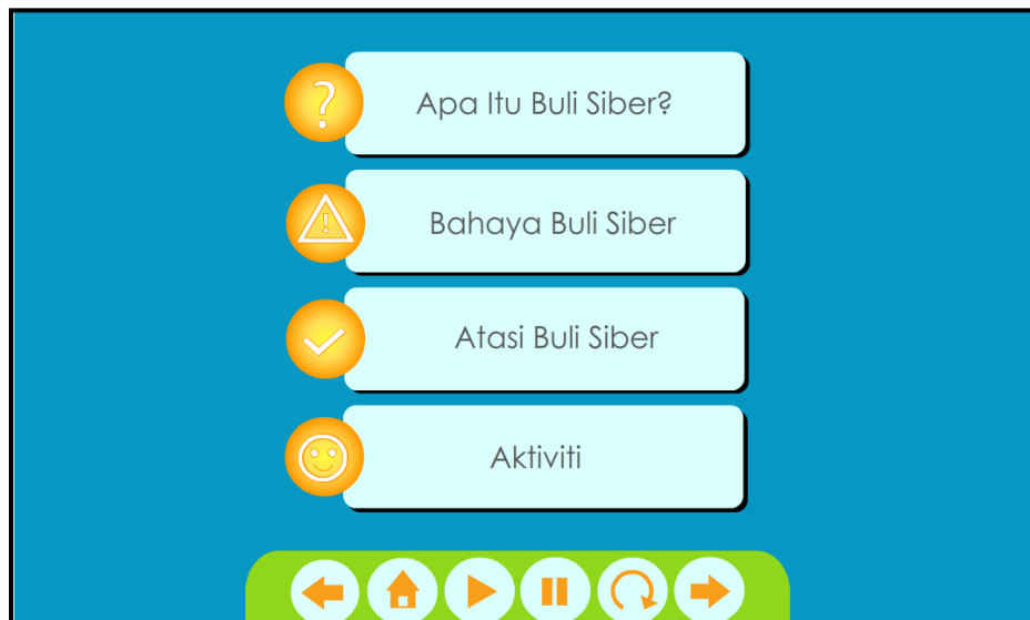
Figure 5: Screenshot of Main Menu of the Multimedia App

Information resources are also presented to learners in this app. Jonassen (1999) suggested that the developer provides learner-selectable information just-in-time to foster problem solving and conceptual development. For that, learners are free to select whichever module in this app to learn first according to her or his aptitude. Learners can also return to the modules that they have learnt according to necessity. Figure 5 shows the main menu consisting of modules that have been prepared in this app, which can be selected by users. The menus consist of the (i) definition of cyber-bullying, (ii) the danger of cyber-bullying, (iii) how to overcome cyber-bullying and (iv) activities.