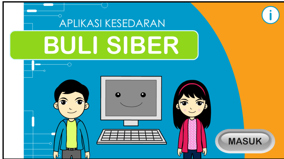
Figure 6: Screenshot of Main Menu from the Multimedia App

The cognitive tools are important component that could scaffold required skills, including problem-representation tools, knowledge-modelling tools, performance-support tools, and information-gathering tools (Jonassen, 1999). Kommers, et. al (1992) defined cognitive tools as generalizable computer tools that could be used to engage and facilitate cognitive processing. In this research, the content of the Multimedia App act as the problem-representation tools as they help learners to visualize and construct the mental model about how the objects behave and interact. Figure 6,7,and 8 shows some of the screenshots based on the contents of the Multimedia App. Besides that, this also acts as knowledge modelling tools whereby it helps the learners to make their understanding of the problem explicit.