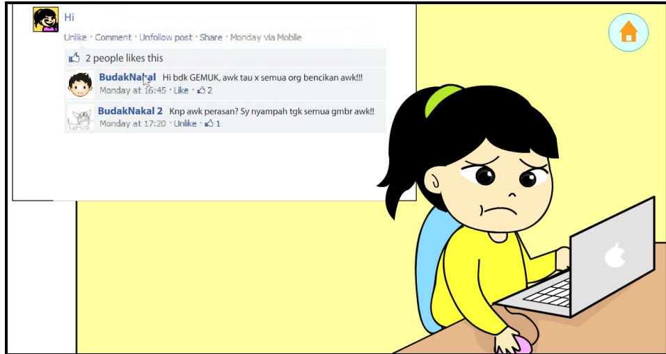
Figure 2: Screenshot of the Introduction Screen